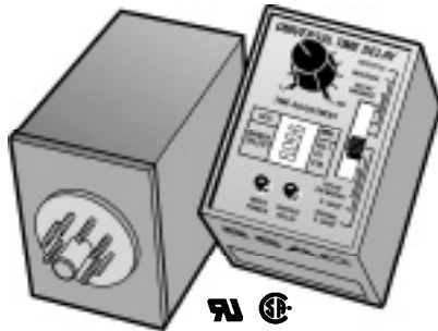
1.78"x 2.39" x 3.44" (45x61x87mm)