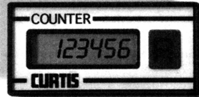
E Case Counter Face with Manual Reset