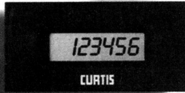
D Case Counter Face