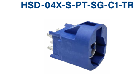
Straight PCB Plug