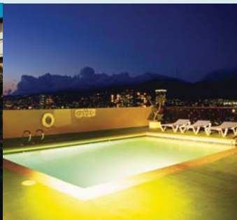
Pool / Spa