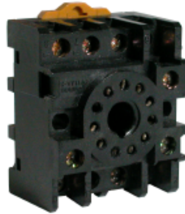
PF113A 10A Rating