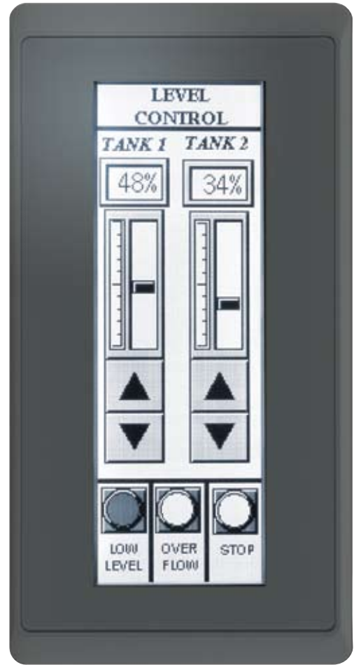
The HG1F is bright enough to be read easily in sunlight.