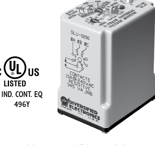
Universal Phase Monitor w/ Rapid Cycle Lockout