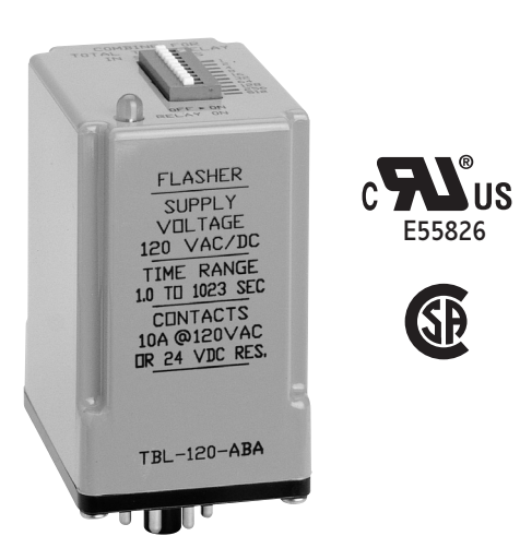
Flasher DIP Switch TDR