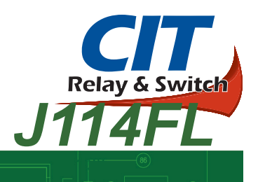
Dimensions - 12amp Single Pole