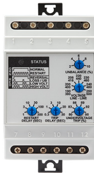
PMD Series with mounting clips extended

Phase Unbalance: Adjustable from 2 - 10% unbalance. Unit trips when any one of the three lines deviates from the average of all three lines by more than the adjusted set point for a period longer than the adjustable trip delay.