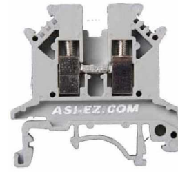
Terminal Width 5.2mm