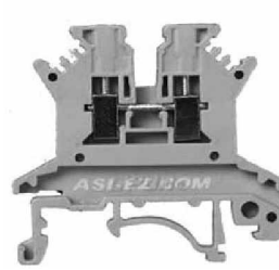
Terminal Width 4.2mm