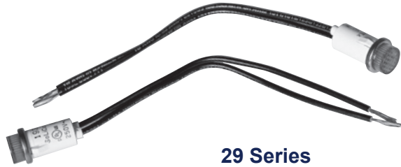
29 Series wire leads snap fit