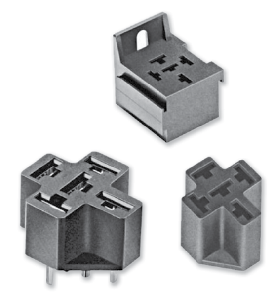
BR SERIES - 5 Pin Automotive Relay Socket

For more information on Custom Connector Corporation please contact us or the representative listed below.